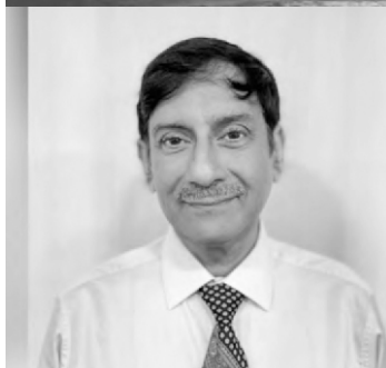
Pradhan: a welcome move

to combat piracy, not only in our territorial waters but in the exclusive economic zones and also on the high seas. He said: "India's security and economic well-being is linked with the sea and maritime security is a prerequisite with more than 90 per cent of our trade with the world taking place through sea routes and more than 80 per cent of our hydrocarbon requirements being seaborne. The security of sea lanes of communication is critical to our national well-being. India is also one of the largest providers of seafarers in the world. The passing of this bill is a logical follow-up of India's maritime initiatives and will also enhance India's maritime security, including that of India's trade routes and the welfare of Indian seafarers in international waters."